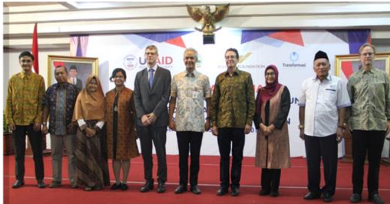
Picture 5: Kick-Off Meeting with Strategic Partners: Governor Central Java, USAID Mission Director to Indonesia, Director Training Ministry of Manpower, DAI Mitra Kunci Chief of Party, Local NGO Transformasi and Youth Champions