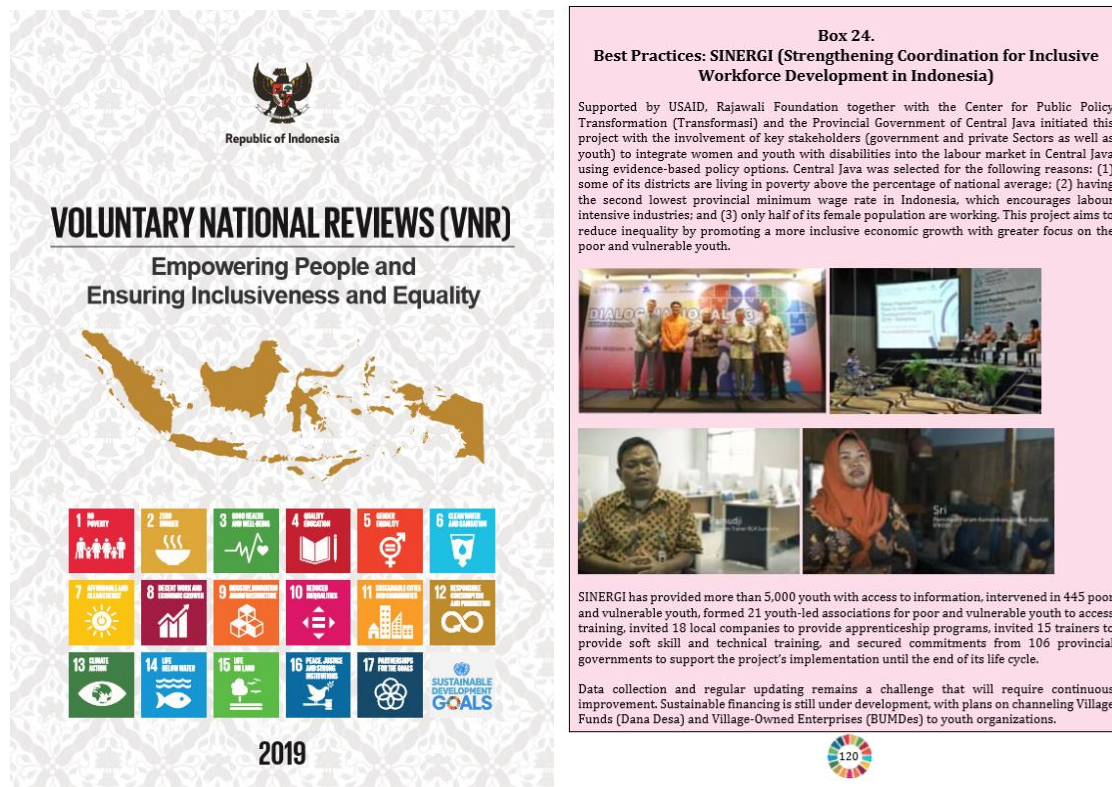
Picture 7: SINERGI project was highlighted in the 2019 VNR of the Republic of Indonesia, page 120

July 2019 – Bp. Bambang Soemantri Brodjonegoro Minister of National Development Planning featured SINERGI project as one of 30 best practices in Indonesia to promote and ensuring inclusiveness and equality in the United Nations High Level Political Forum on SDGs in New York, USA.