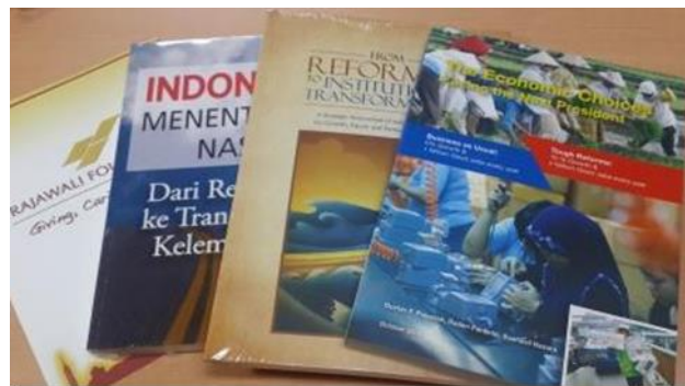
Picture 10: Previous Publications: From Reformation to Institutional Transformation (2010 in English and Bahasa); Economic Choices Facing the Next President (2014).