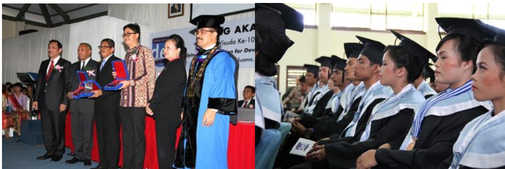
Picture 12: There are 25 Rajawali Foundation IT DEL scholarship recipients. Picture on the left: Rajawali Foundation Executive Director attended one of IT DEL inauguration ceremonies in North Sumatera. Photo was taken prior Covid19 pandemic.

School Development Program - Ongoing scholarships for selected students and teachers at schools such as Yayasan Elsafan that deliver formal education for blind students; and IT DEL scholarships program which delivers technology education for bright students from poor and vulnerable backgrounds. The last batch of scholarship program graduated in second semester 2021.