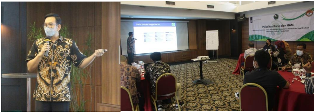
Picture 1: Rajawali Foundation Senior Manager facilitated training on business and human rights: human rights due diligence. The event was initiated by ELSAM, LPSK with support from the Netherland Embassy in Indonesia (12 June 2021)