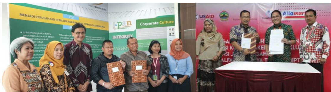
Picture 6: Strategic partnership with PT. PanBrothers leading garment company in Indonesia and Alfamart, nationwide retail companies. The partnership includes commitment to respect human rights and equality (inclusive to women and people with disabilities) – provides equal access to training and job opportunities.