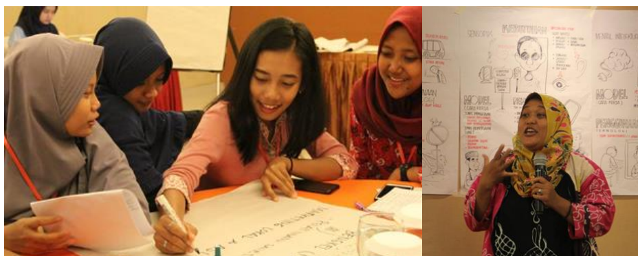
Picture 4: Youth Champions discussed and proposed strategic joint actions to 4 key actors of government-companies-youth-training centres for inclusive workforce development in Central Java

Goal 4 : Quality Education; Goal 5: Gender Equality; Goal 8: Decent Work and Economic Growth; Goal 10: Reduced Inequalities; Goal 17: Partnership for the Goals.