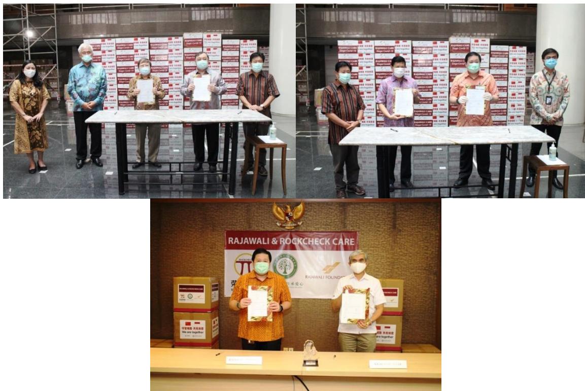
Picture 3: Symbolically handing over medical supplies units donation to Dr. Share which have 150 hospitals partners especially in remote areas (picture on the left), to medical workers in Yogyakarta (picture on the right), and to medical workers in Banten (picture at the bottom) (30 April 2020)

In 2020, Rajawali Care 3 collaborated with Rockcheck Group, one of the leading iron and steel making companies in China which donated 1,070,000 (one million seventy thousand) units of medical supplies, including masks and gloves, to help mitigate the Covid19 pandemic in Indonesia. The shipment was cleared and channelled, under the auspices of Rajawali & Rockcheck Care program, through the Rajawali Foundation, for prioritized medical workers in the frontlines of affected communities across Indonesia. The distribution covers 8 (eight) provinces in Indonesia: North Sumatera, South Sumatera, Banten, Jakarta, Central Java, Yogyakarta, East Java, and South Kalimantan.