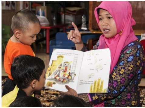
Picture 11: Early childhood teacher demonstrated read aloud using story books from KITA Bercerita program. Photo was taken prior Covid19 pandemic.

School Development Program - Ongoing scholarships for selected students and teachers at schools such as Yayasan Elsafan that deliver formal education for blind students; and IT DEL scholarships program which delivers technology education for bright students from poor and vulnerable backgrounds. The last batch of scholarship program graduated in second semester 2021.